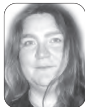
PRODUCTION Tara Gionet