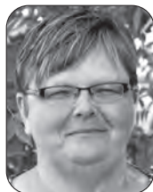
PRODUCTION Nicole Kapusta