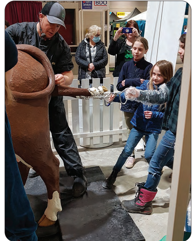
VOICE PHOTOS SUBMITTED

Clover will live at the Manitoba Beef and Forage