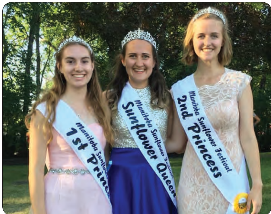
VOICE PHOTO SUBMITTED

"We're still working on some details to confirm a few new events includ-