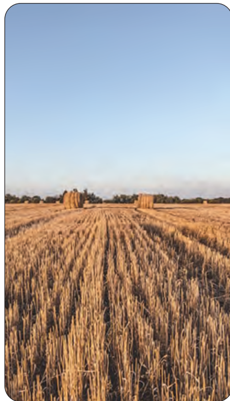
VOICE PHOTO SUBMITTED

"It's important for knowing what the quality of your alfalfa feed is for those who need it for their protein status in either dairy or beef fields," she said. "Last year's drought made