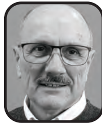
By Randy Smart

Living in a community can be encouraging or exhausting, exhilarating or exasperating. God designed us to get rest each night to renew our mind