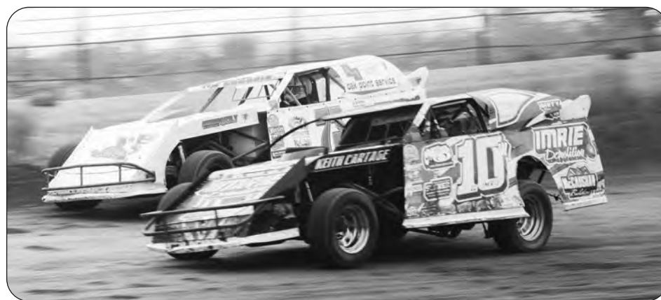
VOICE FILE PHOTO

"That's the best of the best in the region ... the top late model drivers from North Dakota, Minnesota, Wisconsin and Manitoba," said Unrau. "It will bring the top competitors and the top high-powered cars. I can't stress with enough excitement how big of a deal it is to have the NLRA come here to