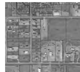
Tower location shown with the star / Emplacement de la tour indiqué par l'étoile

Please support our advertisers SHOP LOCAL