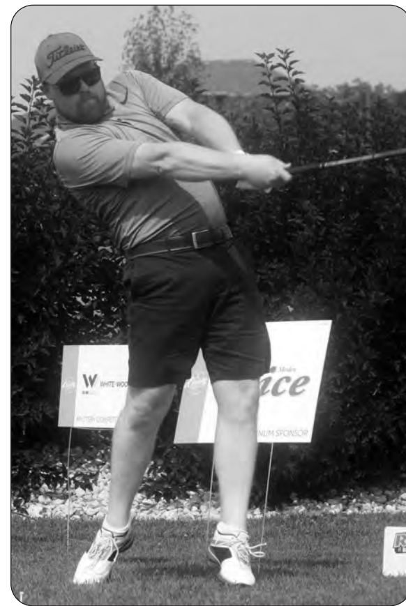
VOICE FILE PHOTO

"It wintered well. A couple of the greens have some winter kill ... but I don't think it should be too much