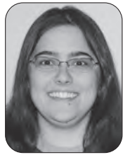
EDITOR Ashleigh Viveiros