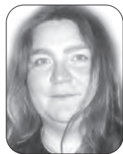
PRODUCTION Tara Gionet