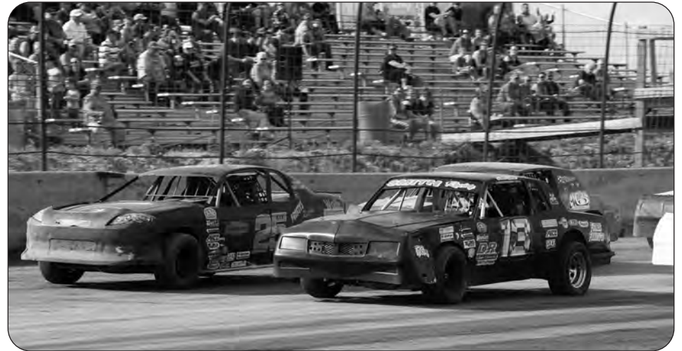
VOICE FILE PHOTO

"WE THOUGHT LET'S PUT ON A COUPLE OF REALLY GOOD EVENTS THAT THE COMMUNITY CAN ENJOY AND BE A PART OF."