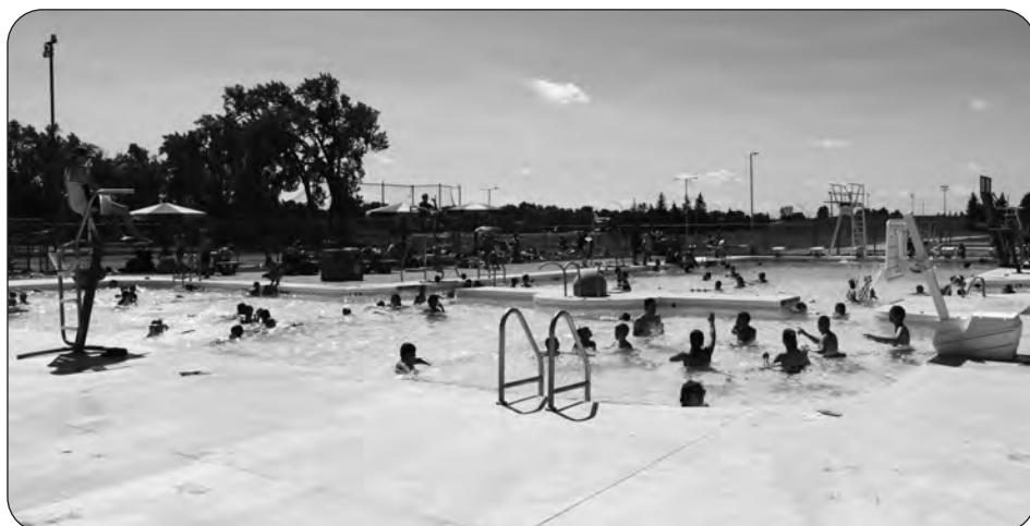
VOICE FILE PHOTO