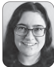
EDITOR Ashleigh Viveiros