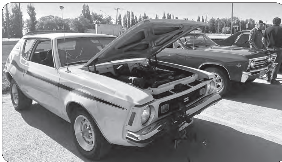
VOICE FILE PHOTO

"The poker thing is just an excuse to go for a drive with our cars," says