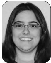
EDITOR Ashleigh Viveiros