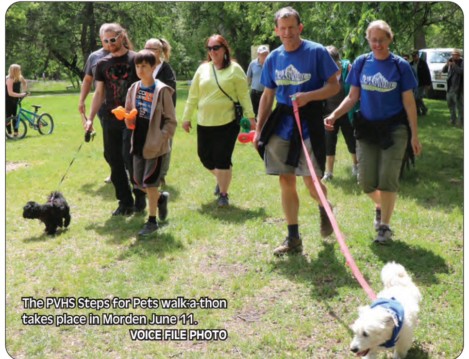
The PVHS Steps for Pets walk-athon takes place in Morden June 11.

Participants have their choice between a three kilometre or a five kilometre route, both of which should bring participants back to the start area by about 3 p.m., at which point there will be an agility demonstration by Extreme Dogs.