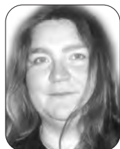
PRODUCTION Tara Gionet