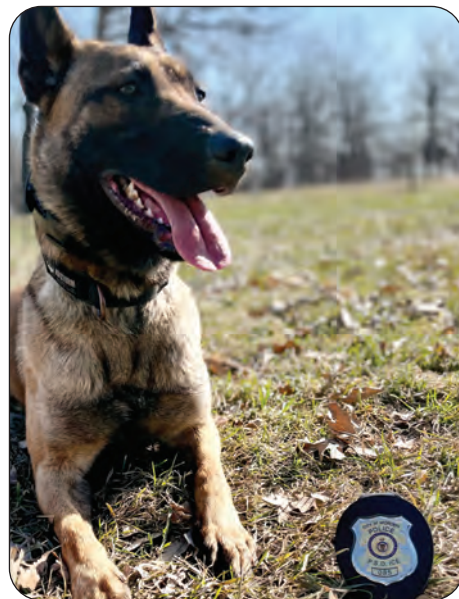
Morden police dog Ice, along with handler Cst. Curtis Warkentin, recently completed eight weeks of drug detection training.

"She's still just a working dog and not a pet," he noted, "but she follows me around when I'm in the yard and at work; she stays pretty close to me, and we're working very well together."