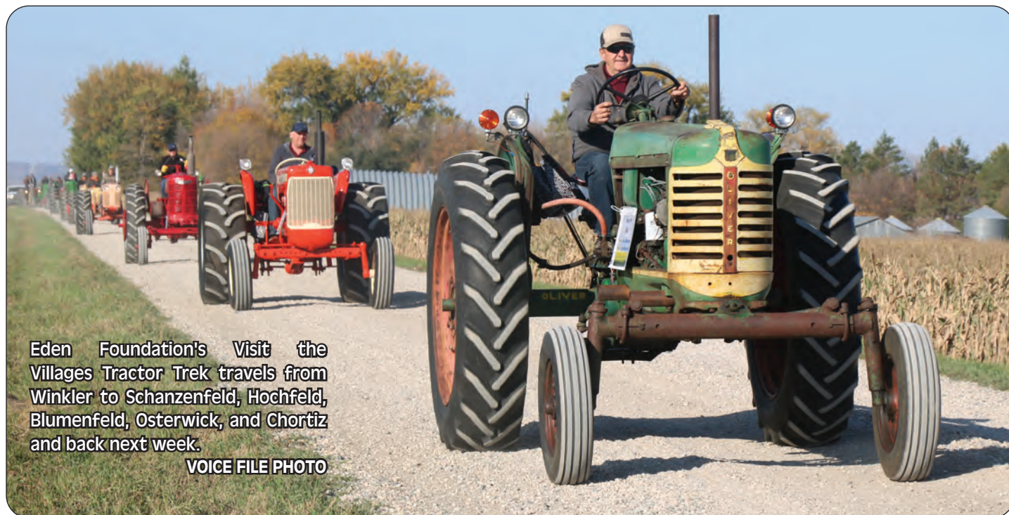
Eden Foundation's Visit the Villages Tractor Trek travels from Winkler to Schanzenfeld, Hochfeld, Blumenfeld, Osterwick, and Chortitz and back next week.

"They'll ask their friends or family or community members or coworkers