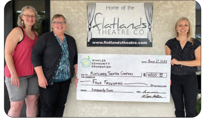
Winkler Community Foundation reps. have been making the rounds this month presenting its 2022 grants to a variety of community groups and projects, including the Pregnancy Care Centre (far left), Imagination Library (left), and Flatlands Theatre Company (above).