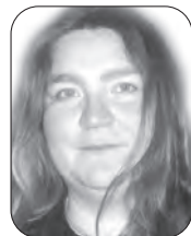
PRODUCTION Tara Gionet