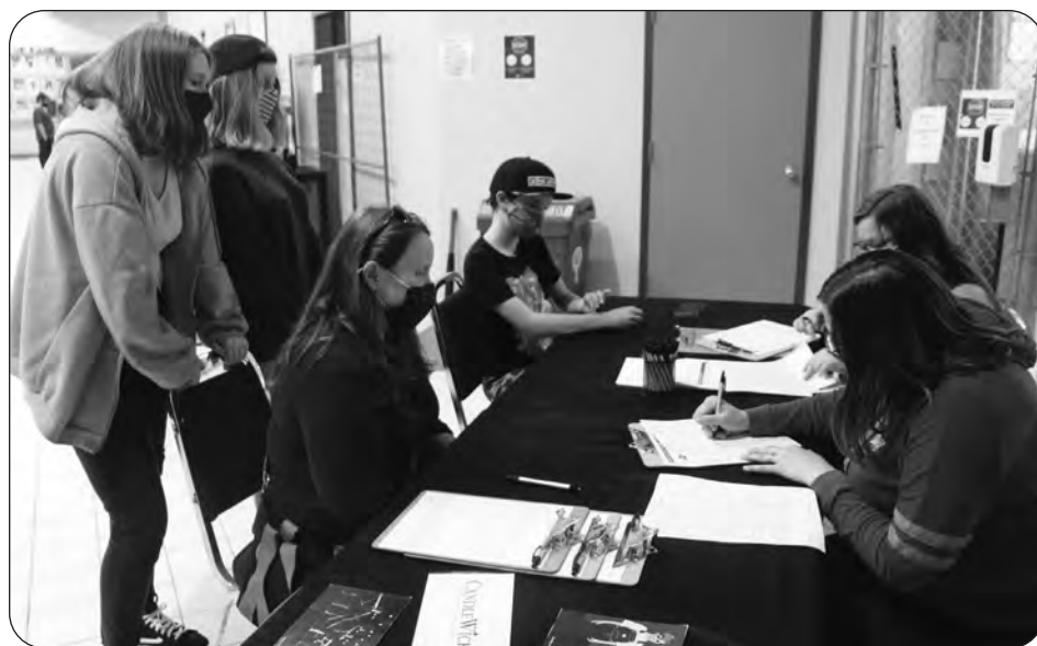
VOICE FILE PHOTO

"It is on a smaller scale since the pandemic ... and different groups have worked around it and are doing things a little differently," she said. "There's also just a lot of online regis-