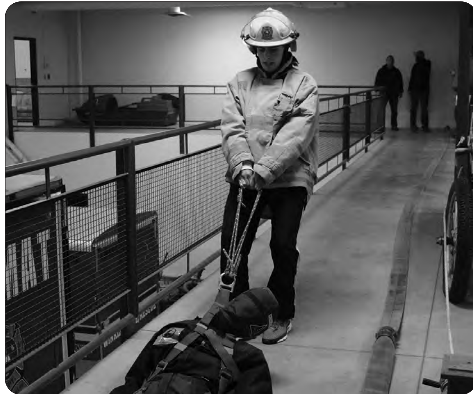
VOICE FILE PHOTO

The Pembina Valley Watershed District promotes conservation practices such as these. If you want to learn more about PVWD, please visit our website at pvwd.ca or connect with us on Facebook, Instagram, or Twitter.