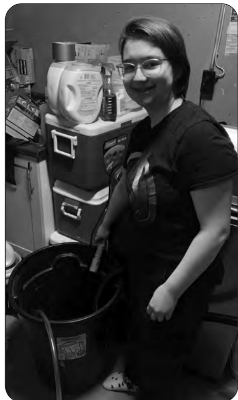
Submitted by Julia Konrad, Pembina Valley Watershed District

Greywater is gently used wastewater from household appliances such as bathtubs, washing machines, and bathroom sinks. This water is NOT blackwater, which comes from sewage. Greywater can be used to water plants or flush toilets.