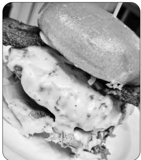
The Mac, Altona Hotel's Le Burger.

From Sept. 1 to 14, participants will be able to discover new restaurants while indulging in specialty burger creations never tasted before through Le Burger Week 2022.