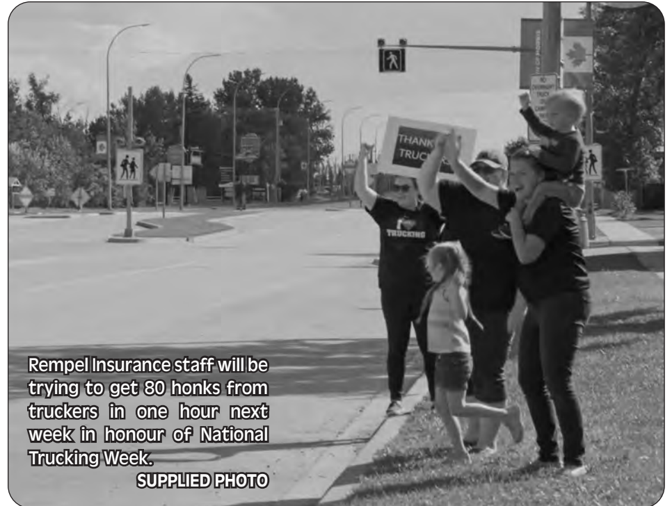
Rempel Insurance staff will be trying to get 80 honks from truckers in one hour next week in honour of National Trucking Week.

"The industry is also incredibly committed to ensuring safety in everything they do to keep our roads safe. We believe that National Trucking Week is an important time to recognize that dedication and express our gratitude for it."