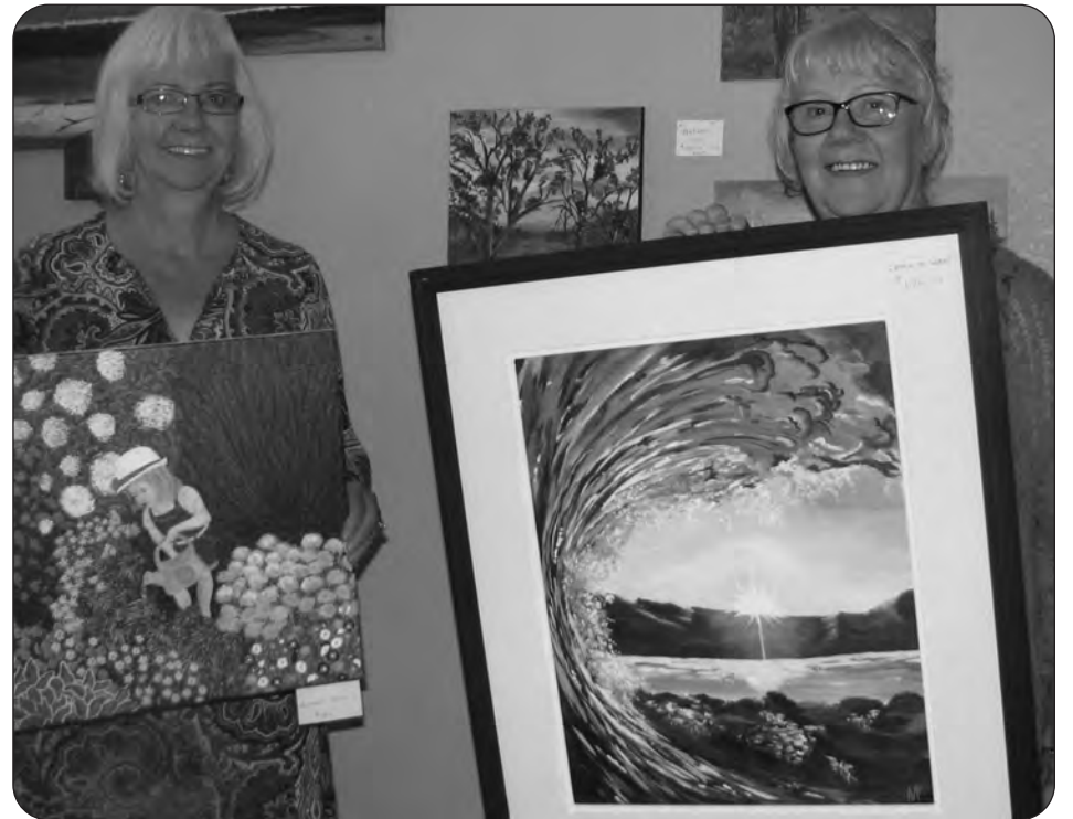
VOICE FILE PHOTOS

"IT'S A DIVERSE GROUP OF ARTISTS WHO WORK IN A WIDE VARIETY OF MEDIA ..."