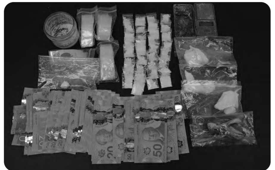
WINKLER POLICE PHOTO

Police seized drugs, money, and trafficking paraphernalia in a bust last week.