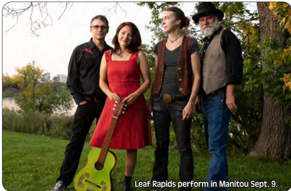
Leaf Rapids perform in Manitou Sept. 9.