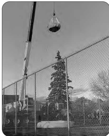
For a second straight year, organizers hoisted a gigantic pumpkin into the air for onlookers to see it come smashing down.

What's surprised Axten most since starting these practices is how every-