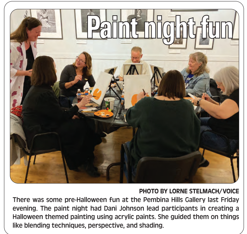
Paint night fun

"THIS WILL BE ONE WAY OF MAYBE ADDRESSING THE STAFFING ISSUE ON A BIT MORE OF A PERMANENT BASIS."