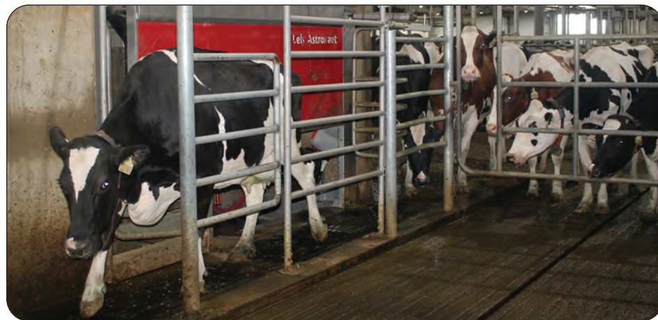
After they're milked in the robotic station, cows are routed through automated gates.

Comfort is key for maximizing milk production, which averages 41 litres daily per milking cow. Each day, Halarda Farms ships out about 50,000 litres, and all the milk is sold through the non-profit Dairy Farmers of Mani-