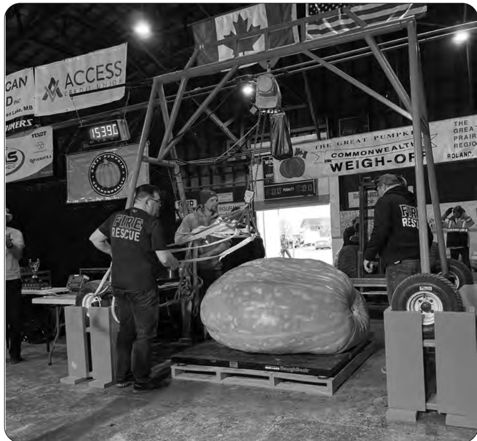
Each pumpkin is placed on the scale for the weigh-in.